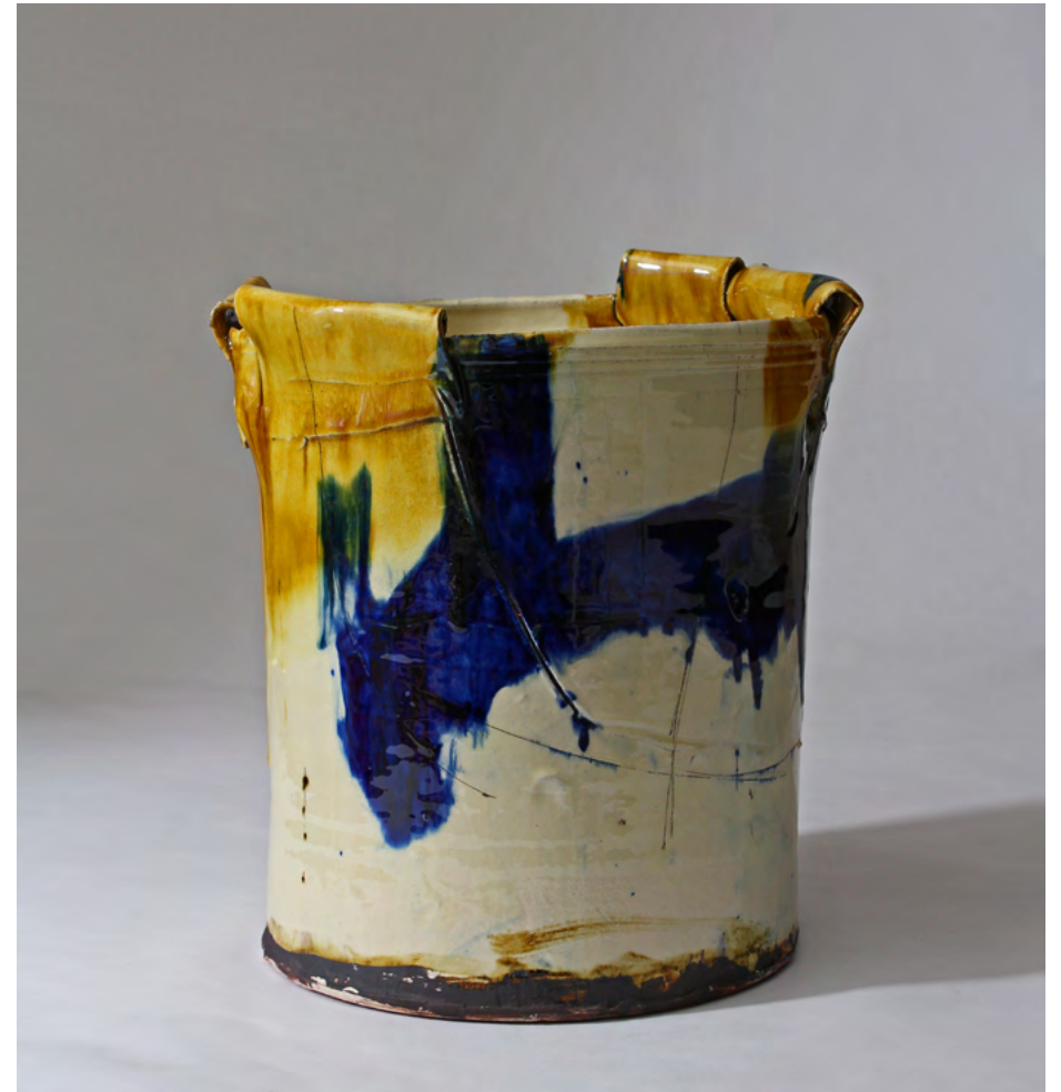
Thrown and altered vessel, 2020 At any moment series 29 x 16 cm