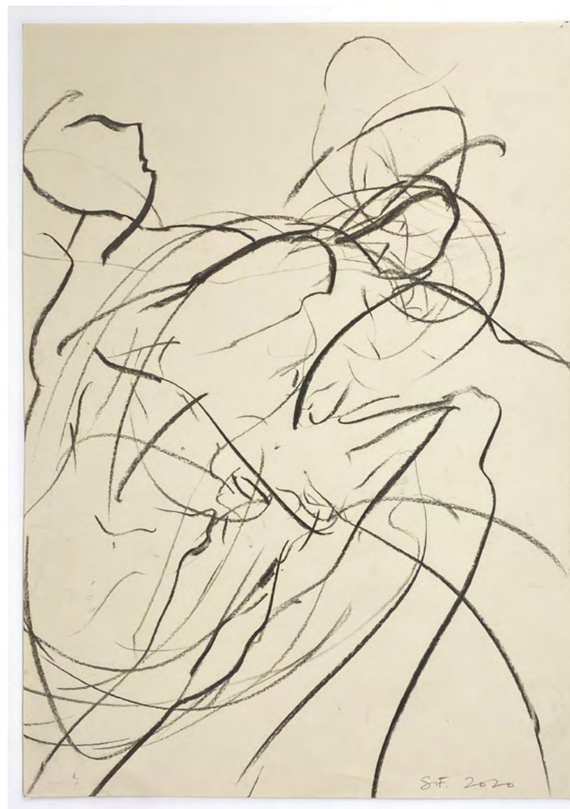
Poussin Dancers, 2020 Charcoal on paper 59.4 x 42 cm