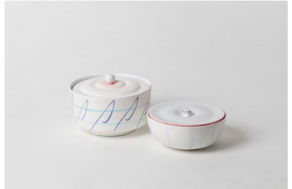
Pastille Box (B1, B2), 2020 Bone china