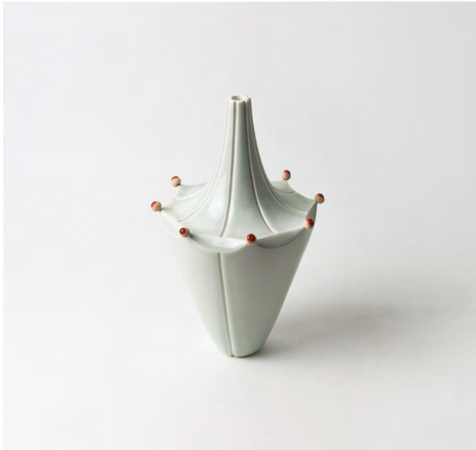
Large Carrier Jar, 2020 Paste series Earthenware and glass