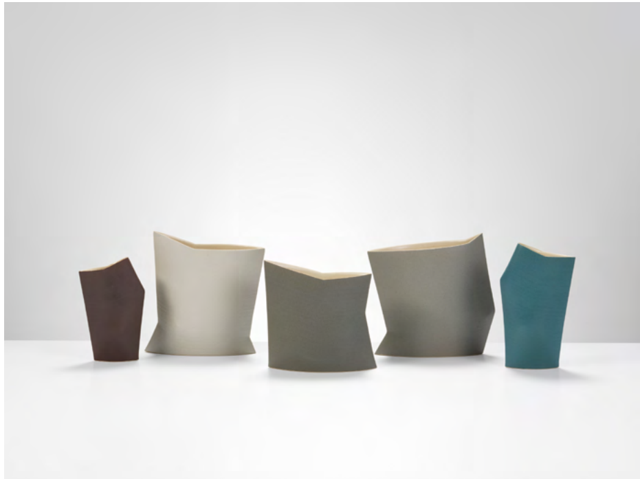
Geometric vessels, 2019 50 x 19 cm