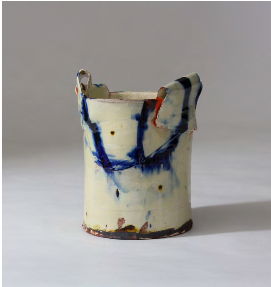
Thrown and altered vessel, 2020 At any moment series 17 x 15 cm