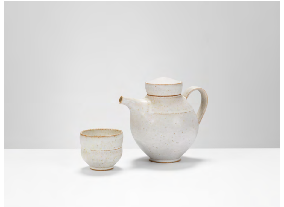
Teapot set, 2019 13 x 14 cm