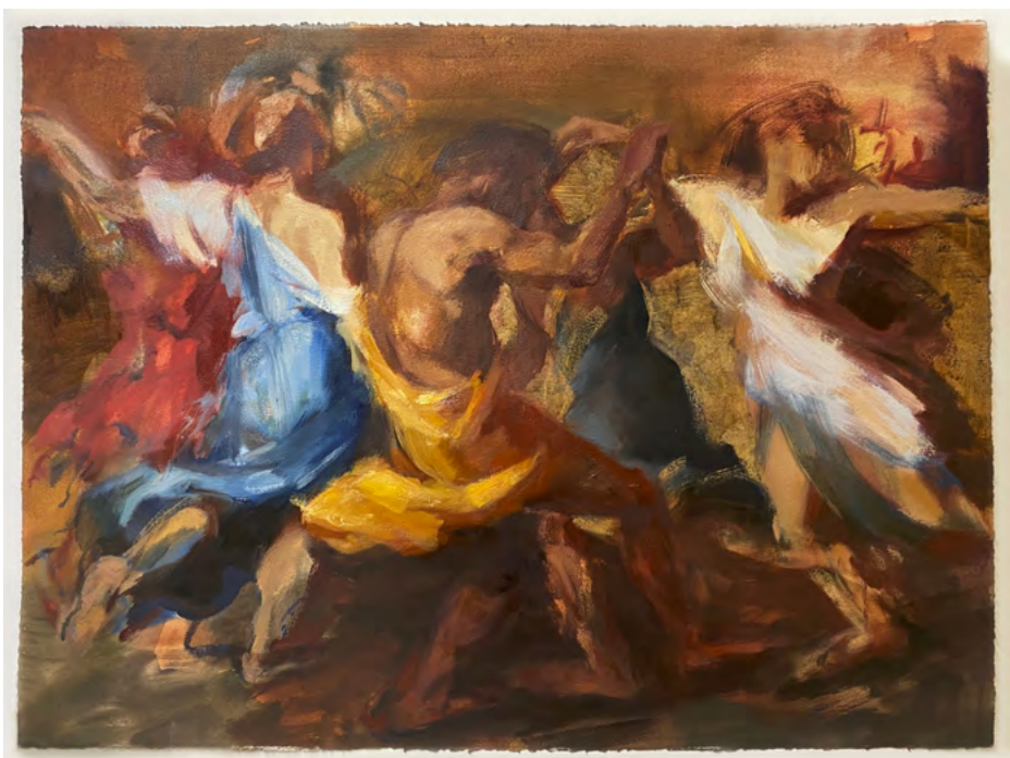
The Dance (after Poussin), 2020 Oil on Arches paper 56 x 76 cm